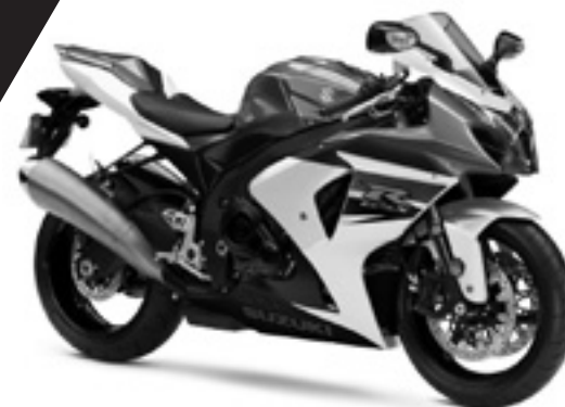
The All Conquering GSX-R1000